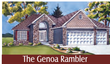
The Genoa Rambler