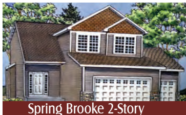
Spring Brooke 2-Story